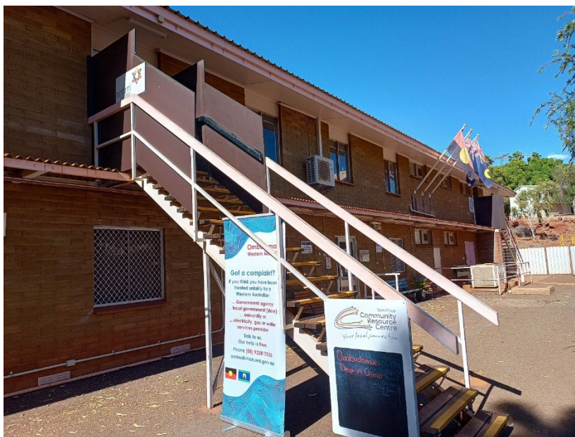
The Office held a drop-in clinic at the Tom Price Community Resource Centre in November 2022.