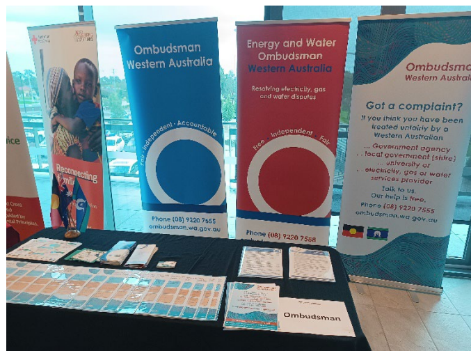
The Office held an information stall at the Multicultural Communities Council of WA mini-expo in June 2023.