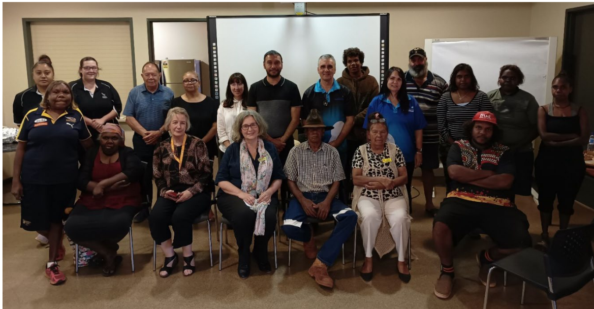
Attendees at the Information session for the Aboriginal community, Elders and service providers in Newman, November 2022, with representatives from the Office, the Commonwealth Ombudsman, Equal Opportunity Commission, Health and Disability Services Complaints Office and Office of the Information Commissioner (WA).

The Program also provides a valuable opportunity for staff to strengthen their understanding of the issues affecting people in regional and Aboriginal communities.