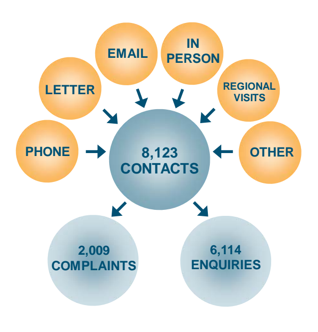
Contact can be made with the Ombudsman's office in a number of ways.