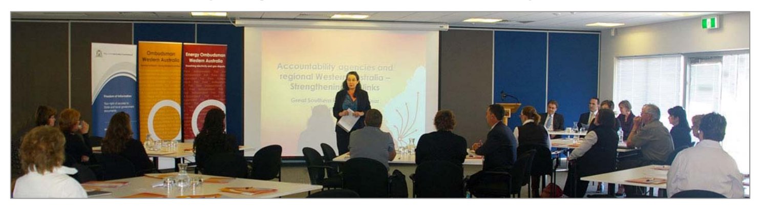
The accountability agencies spoke to government agencies from the Great Southern Region.

The Western Australian Ombudsman visited Albany in the Great Southern Region between 17 and 19 November as part of the Ombudsman's Regional Awareness and Accessibility Program. Joining the Ombudsman on the visit was the Information Commissioner and senior staff from the Office of Heath Review and the Commonwealth Ombudsman's office.