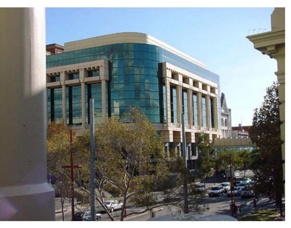
Above: View of Albert Facey House from the Perth train station overpass.