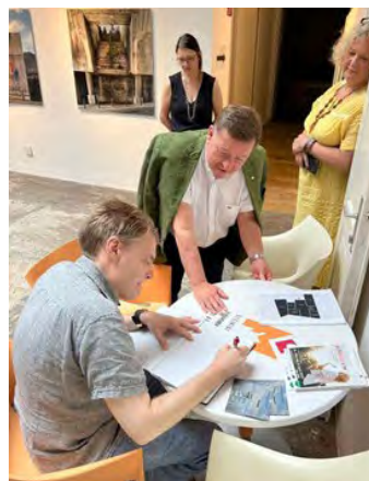
Left to right: The President of the IOI and former Secretary General of the IOI.

On 5 June 2022, the President was provided a private tour of the Feuerwehr Verband (Fire Brigade Association and Museum St. Florian). The President was very grateful to the wonderful Directors of the Museum for being such generous hosts.