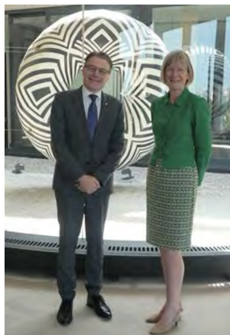
Left to right: The President of the IOI and the Australian Ambassador to France.