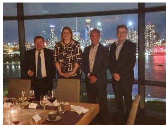
Left to right: Former Secretary General of the IOI, New Zealand's Ambassador and Permanent Representative to the United Nations in New York, and Chief Ombudsman New Zealand, and the President of the IOI.