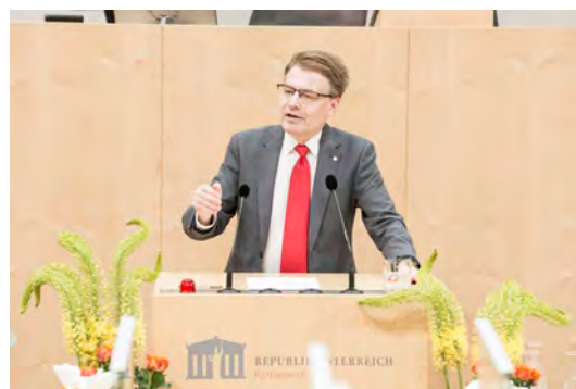
President of the IOI.

The President was also honoured to provide an address at the Parliament of the Republic of Austria on the occasion of the 10 th anniversary of the Austrian Ombudsman Board's Optional Protocol to the Convention against Torture (OPCAT) mandate on 7 June 2022.