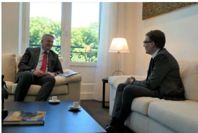
Left to right: Secretary-General of the OECD and the President of the IOI.

It was the President's privilege to meet with the Secretary-General of the Organisation for Economic Co-operation and Development (OECD), Mr Mathias Cormann. The Secretary-General was incredibly gracious to meet with the President in Paris coinciding with the President's official visit to Graz and Austria.