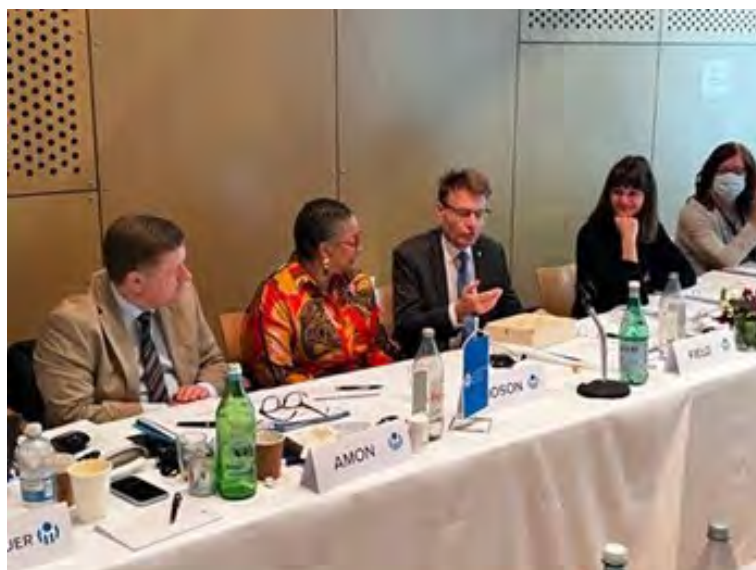
Left to right: Former Secretary General of the IOI, the United Nations Ombudsman, the President of the IOI, the President's Chief of Staff and First Vice President of the IOI.