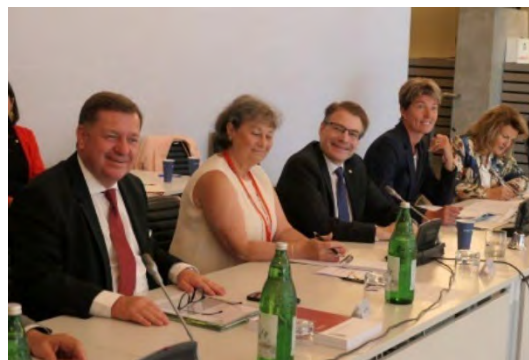
Left to Right: The former Secretary General of the IOI, the President of the IOI.

The President was given the great privilege to appear before the People's Advocacy Committee of the Parliament of the Republic of Austria on 8 June 2022. After providing an introductory statement, the President was delighted to answer a series of deeply thoughtful questions from the Honourable Members of the Committee.