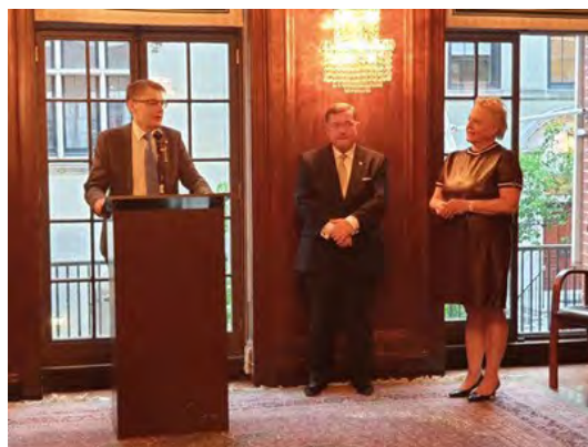
Left to right: The President of the IOI, former Secretary general of the IOI and Austrian Consul General.