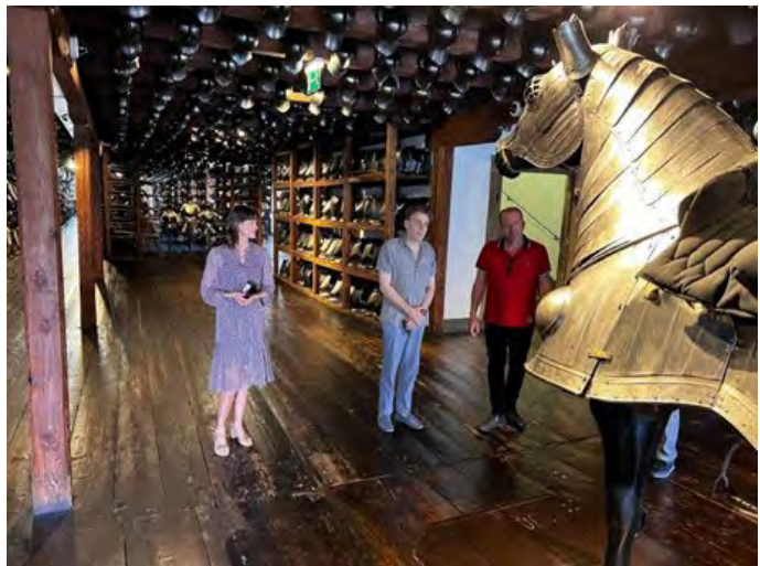
Left to right: The President's Chief of Staff, the President of the IOI and Director.

As part of the President's official visit to Graz, on 4 June 2022 the President was provided a guided tour of the Landeszeughaus in Graz, the world's largest historic armoury. The President was very grateful to the Director and guide for sharing with us this superb museum.