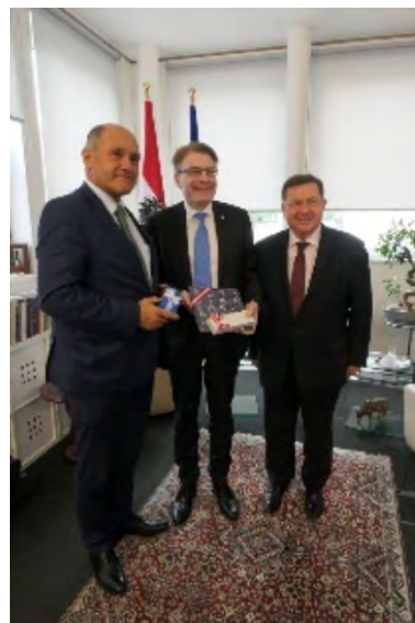
Left to right: Federal President of the National Council of the Republic of Austria, the President of the IOI and former Secretary General of the IOI.

It was a great honour for the President to meet with the Federal President of the National Council of the Republic of Austria, Wolfgang Sobotka on 9 June 2022. His Excellency and the President discussed the work of the Ombudsman institution internationally with regard to its role in upholding democratic principles, good governance, the rule of law and human rights.