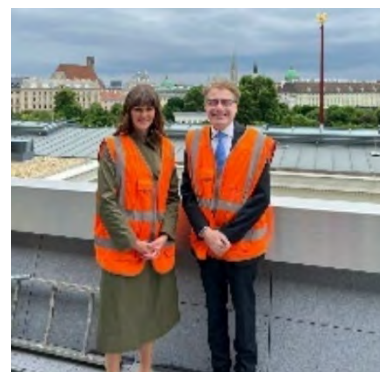
Left to right: The Ombudsman's Chief of Staff and the President of the IOI.