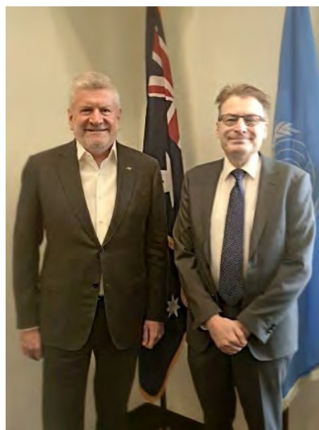
Left to right: Australia's Ambassador and Permanent Representative to the United Nations in New York and the President of the IOI.

The President met with the Australian Ambassador and Permanent Representative to the United Nations in New York, the Hon. Mitch Fifield. The Ambassador and the President were able to undertake an extremely useful dialogue regarding strengthening the relationship of cooperation and collaboration between the IOI and the United Nations. The President is exceptionally grateful to Ambassador Fifield and the Australian Government for their ongoing support of his role as President of the IOI and for the institution of the Ombudsman in its work in promoting good governance, the rule of law and human rights.