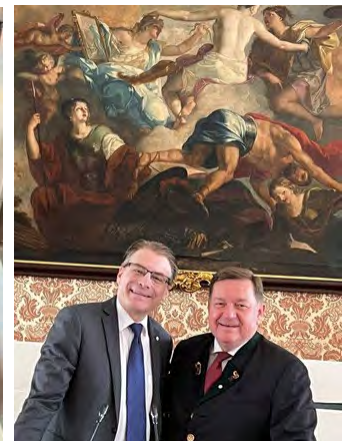
Left to right: The President of the IOI and former Secretary General of the IOI.