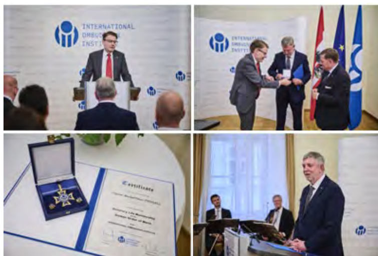
Top left: The President of the IOI; Top right: the President of the IOI, former President of the IOI and Ombudsman and Information Commissioner of Ireland and former Secretary General of the IOI; Bottom left: Golden Order of Merit; Bottom right: former President of the IOI and Ombudsman and Information Commissioner of Ireland.