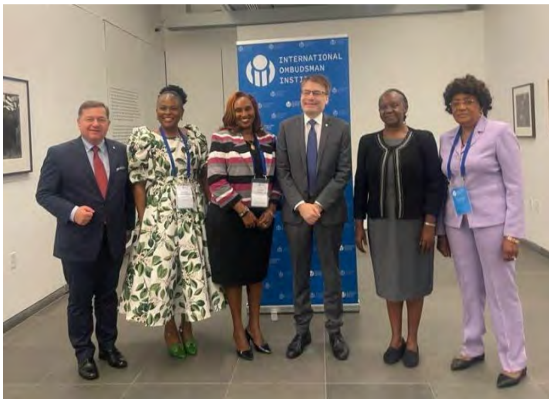
Left to right: Former Secretary General of the IOI, Public Protector South Africa, Chairperson of the Commission on Administrative Justice (Office of the Ombudsman) Kenya, the President of the IOI, Public Protector Zambia and Provedoria de Justiça de la República de Angola (Ombudsman of the Republic of Angola).