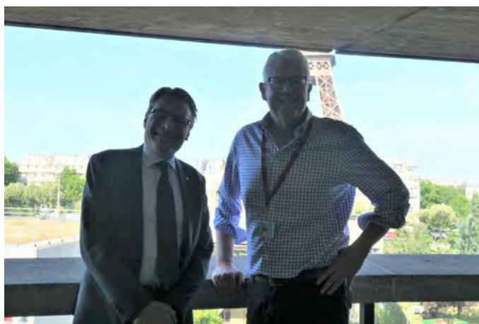
Left to right: The President of the IOI and Ambassador and Permanent Representative of Australia to the OECD.