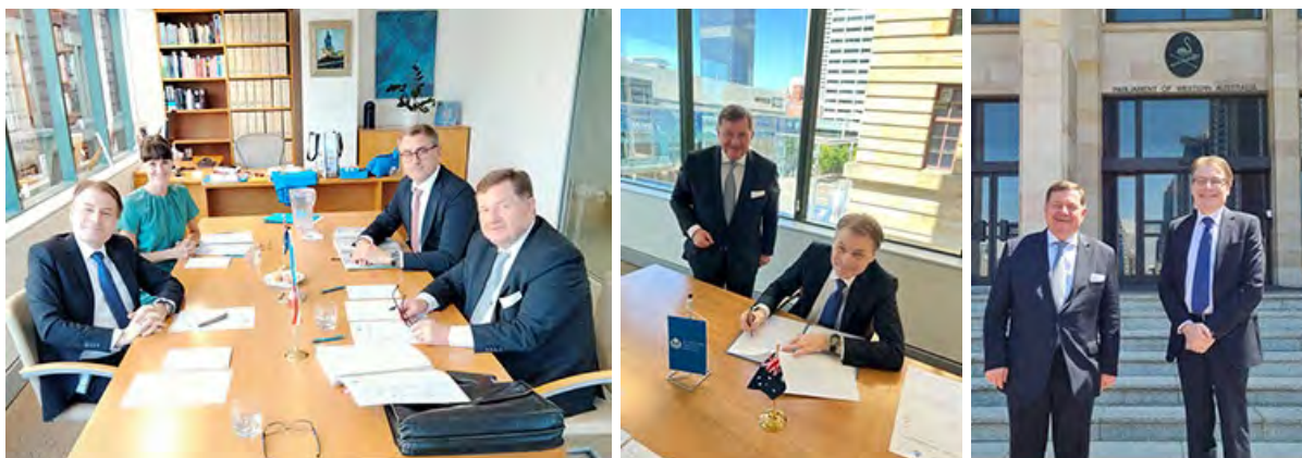
Top left: The President of the IOI, the President's Chief of Staff, former Executive Director of the IOI, and former Secretary General of the IOI; Centre: Former Secretary General of the IOI and the President of the IOI; Right: Former Secretary General of the IOI and the President of the IOI.