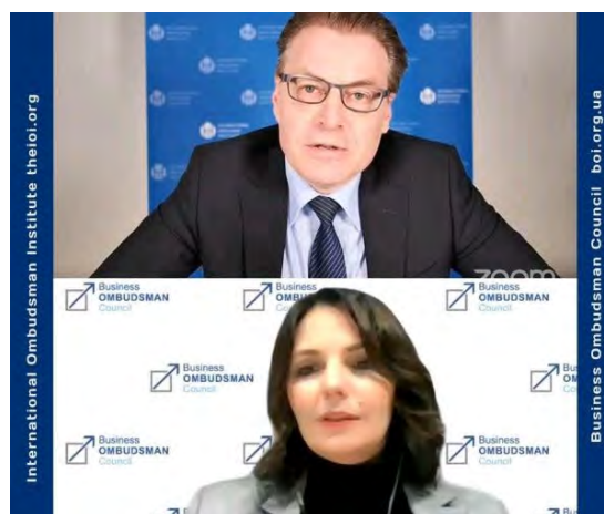
Top: The President of the IOI; Bottom: Deputy Business Ombudsman of Ukraine.