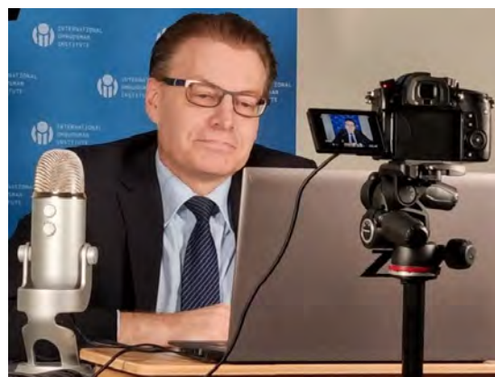
Ombudsman and President of the IOI.