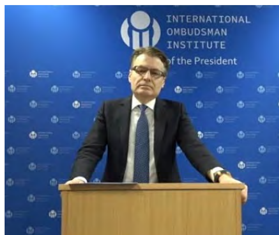
Ombudsman and President of the IOI.

Video recorded and written speeches by the Ombudsman as President of the IOI are available on the President's Speeches and Engagements page of the Ombudsman's website .