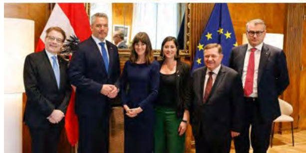
Left to right: The President of the IOI, Federal Chancellor of Austria, the Ombudsman's Chief of Staff, the Personal Assistant to the former Secretary General of the IOI, the former Secretary General of the IOI and the former Executive Director of the IOI.

On 4 June 2022, it was the President's honour and privilege to meet His Excellency Mr Hermann Schützenhöfer, Governor of Styria. It was a genuine pleasure for the President to discuss with His Excellency the vital work of the IOI in protecting and promoting human rights, good governance and the rule of law. The President also discussed the very valued friendship of Austria and Australia, including our recently entered Strategic Cooperation Arrangement. His Excellency has made an extraordinary contribution to public life over five decades. It was particularly generous of him to receive the President as one his last acts in office.