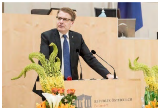
President of the IOI.