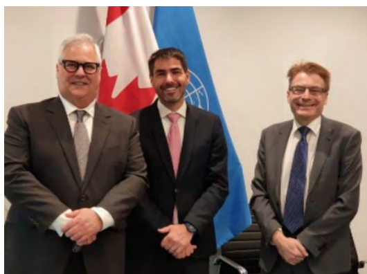
Left to Right: Ontario Ombudsman, Canada's Ambassador and Deputy Permanent Representative to the United Nations in New York and the President of the IOI.