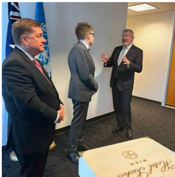
Left to right: Former Secretary General of the IOI, the President of the IOI, and Australia's Ambassador and Permanent Representative to the United Nations in New York.

On 12 May 2021, His Excellency, the Honourable Mitch Fifield, Australian Ambassador and Permanent Representative to the United Nations in New York, hosted a Farewell Reception for the IOI World Board on the occasion of the President's visit to New York.