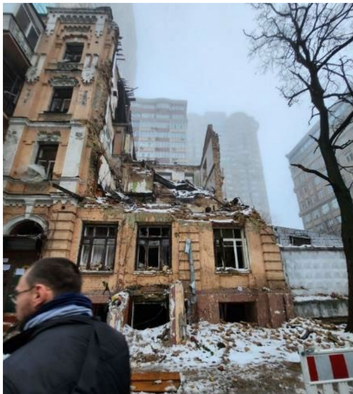
Loss of life and destruction in Kyiv.

The visit then included inspecting captured Russian Federation military equipment, prior to paying respect to those soldiers who have given their lives for their country. The day finished by visiting a 'Point of Invincibility', an 'inflatable' building that has power, tea, coffee, water and beds for Ukrainian citizens, and particularly as the temperature starts to fall to -10 or less, these buildings are heated.