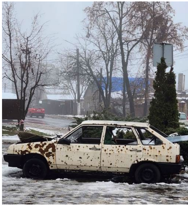
Destruction in Irpin, Ukraine.