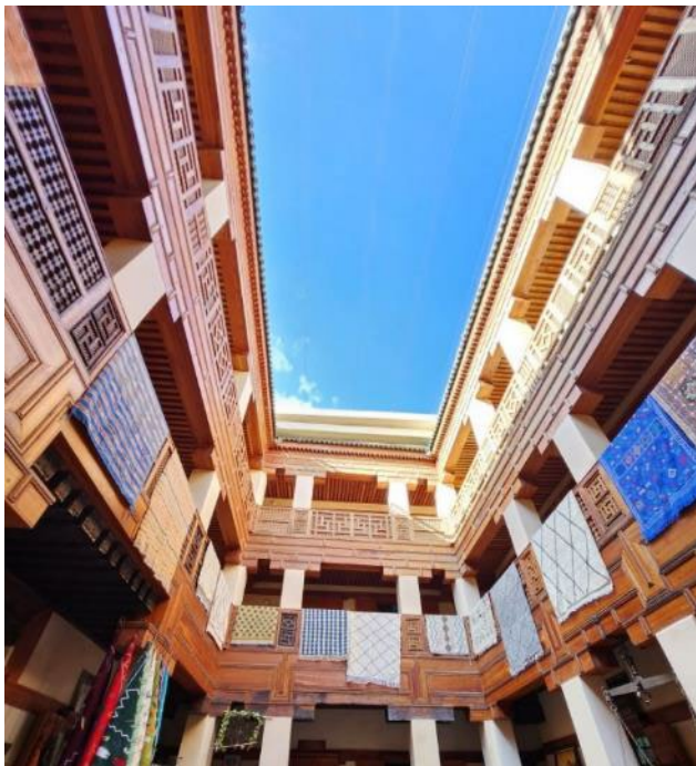
The City of Fez, Morocco.