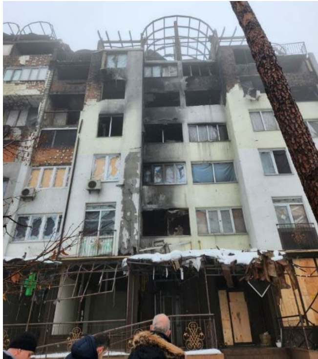
Destruction in Irpin, Ukraine.