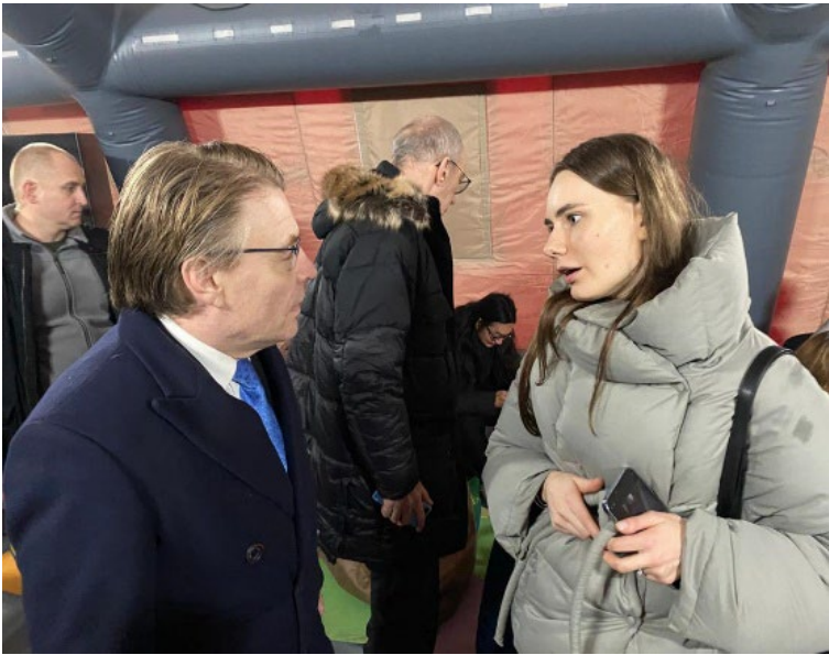
A point of invincibility in Kyiv.