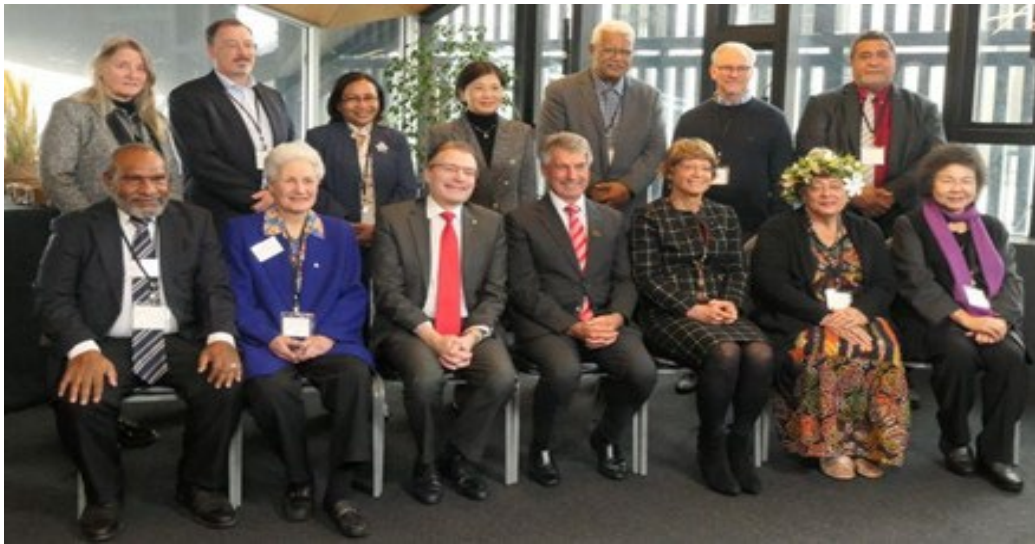
Members of the Australasian and Pacific Ombudsman Region of the IOI.