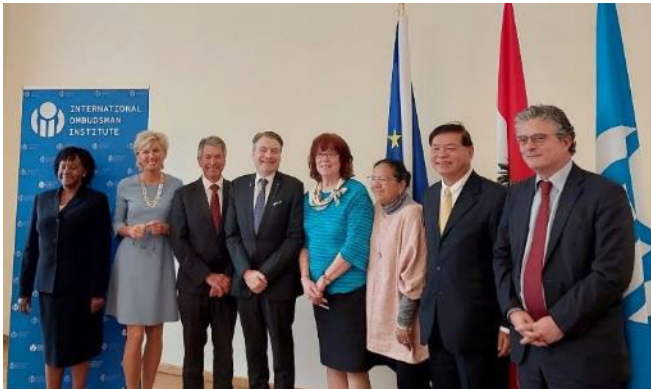
Members of the Executive Committee of the World Board of the IOI.

The IOI President had the pleasure of chairing the 2023 meeting of the World Board of the IOI in Vienna (and the Executive Committee meeting of the World Board and the United Nations Working Group meeting of the World Board).