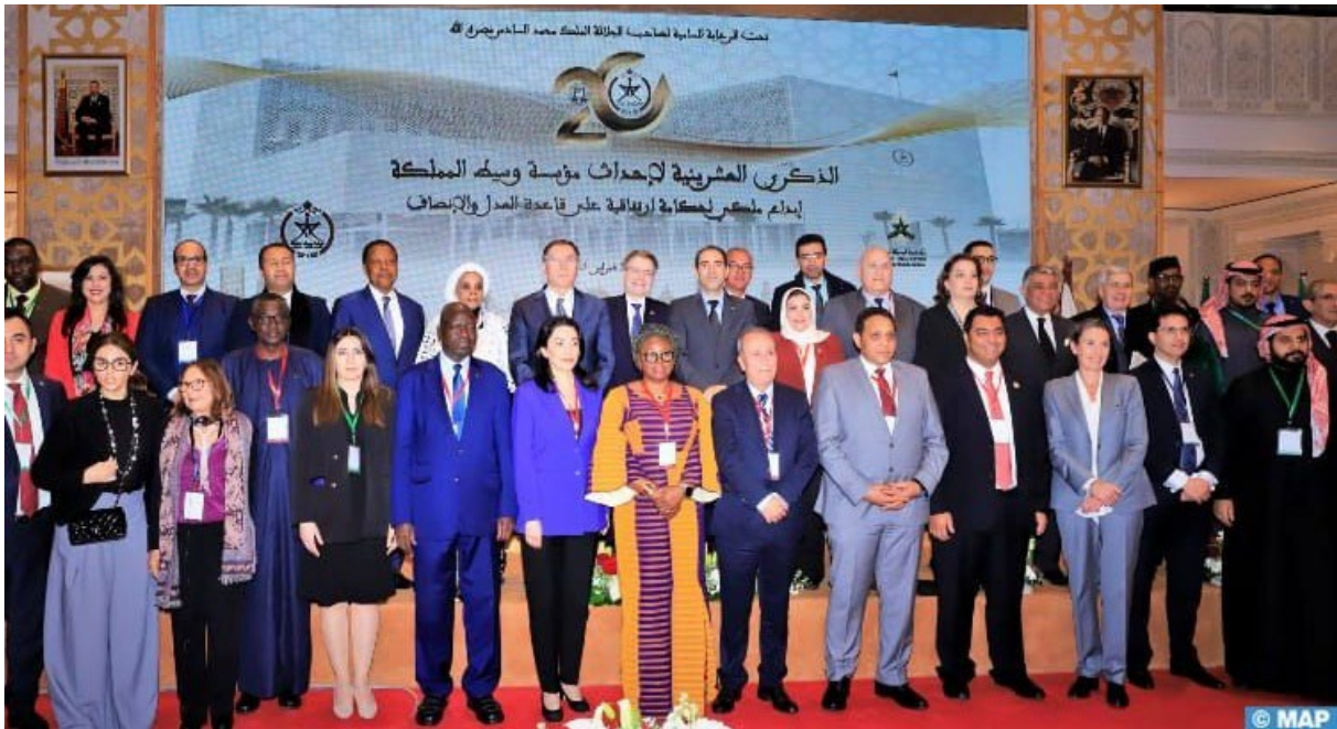
Attendees of the International Conference on the occasion of the 20th Anniversary of the Institution du Médiateur du Royaume (Maroc).