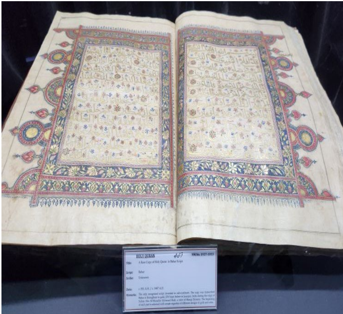
The Holy Quran in Bahar Script.