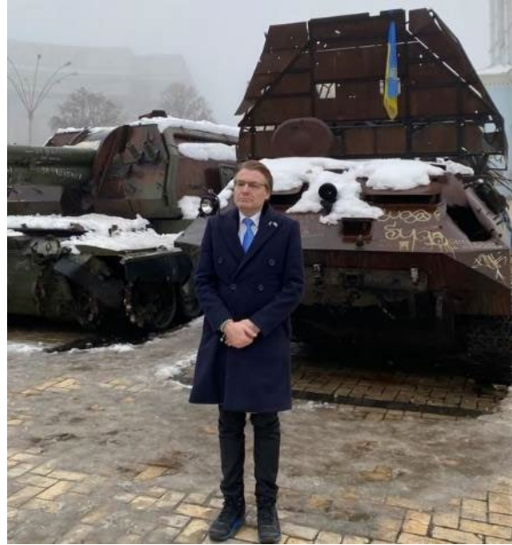
Captured Russian Federation military equipment in Kyiv.