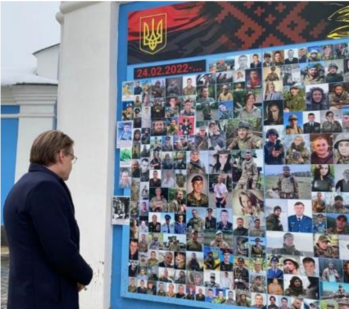
A memorial to fallen Ukrainian soldiers.