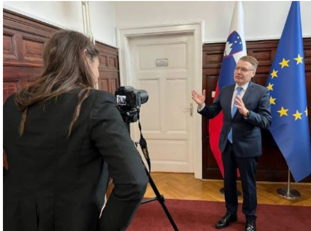
Chris Field PSM, IOI President, at the office of the Minister for Relations between the Republic of Slovenia and the Autochthonous Slovenian National Community in Neighbouring Countries, and between the Republic of Slovenia and Slovenians Abroad.