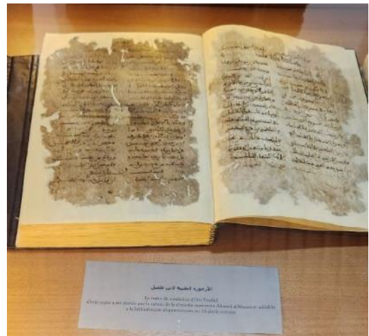
One of the oldest versions of The Holy Quran in the world.