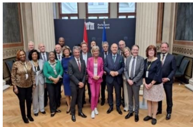
IOI World Board members tour the Austrian Parliament and are welcomed by President of the Austrian National Council, His Excellency Wolfgang Sobotka.

The IOI President had the privilege of being provided a private tour of the Austrian Parliament, along with IOI World Board colleagues. The IOI President and the IOI World Board were welcomed to the Parliament by the President of the Austrian National Council, His Excellency Mr Wolfgang Sobotka and the IOI President was honoured to give the speech in response and renew his acquaintance with His Excellency. In the evening, the IOI World Board had a formal dinner at the Parliament.