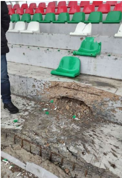
Destruction in Irpin, Ukraine.