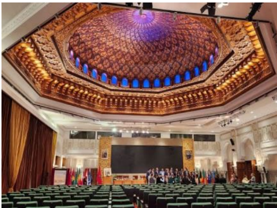
The International Conference on the occasion of the 20th Anniversary of the Institution du Médiateur du Royaume (Maroc).

Later in the day, the IOI President was further delighted to address the Third Session of the conference on examining the Venice Principles and the United Nations Resolution on 'The role of Ombudsman and mediator institutions in the promotion and protection of human rights, good governance and the rule of law' .