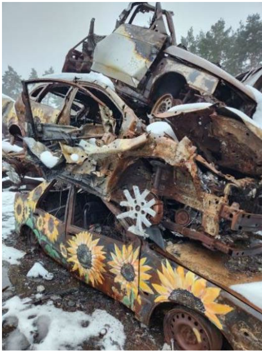
A memorial in Irpin, Ukraine.